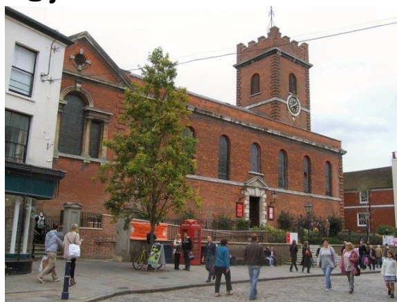
(Holy Trinity Church, Guilford)