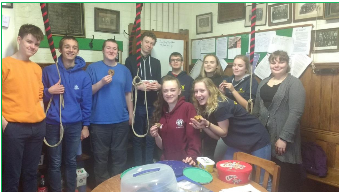
Some Sussex Young Ringers at Hurstpierpoint