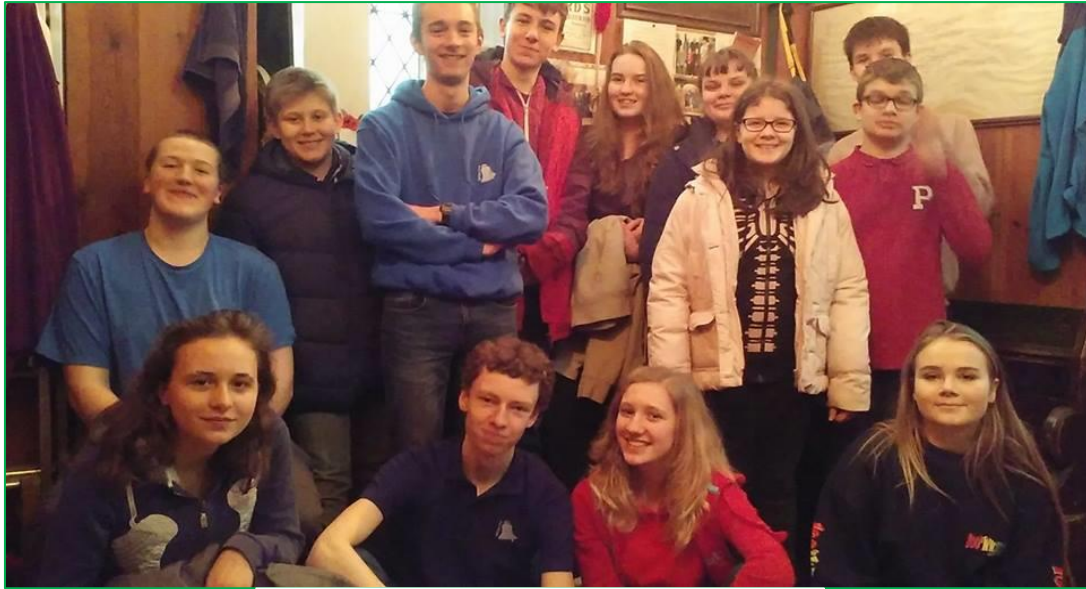
Some Sussex Young Ringers at Burgess Hill

We have recently enjoyed practices with plenty of cake at Southover, Burgess Hill and Hurstpierpoint. The South East Youth Striking Competition is coming up fast on Saturday 14 th April too. This year it is being held by Sussex, at Warnham. We are excited for an enjoyable day in the company of young ringers from all across the south!