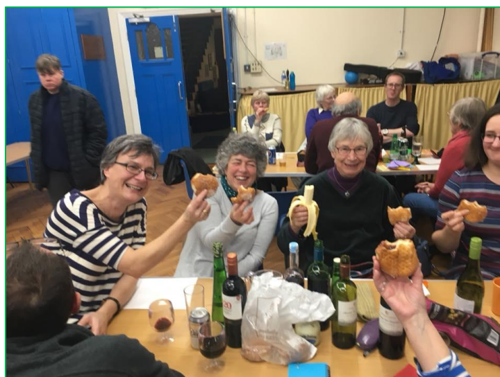
The winning team with their carb overload.

Go to: https://smartringer.org/programme/artm1/ to enrol.