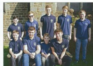
The competing teams (top to bottom): Kent Young Ringers (1st), Sussex Young Ringers (2nd), Essex Young Eagles (3rd), GDGYR (4th) and Young@Herts (5th)