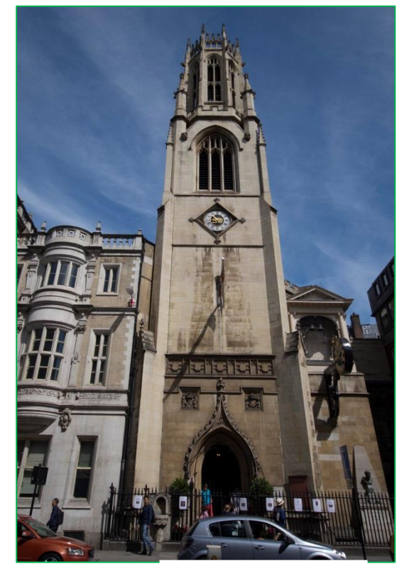
St.Dunstan in the West

As the ringers pulled off the air was filled with the pealing of bells with William the strong of voice calling some changes, the mesmerising motion of the sallys rising and falling reminded me of old pis-