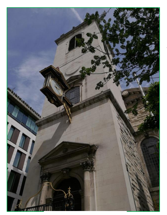
St. James Garlickhythe

ing at the tower the striking was excellent and often much improvement for the less confident ringers.