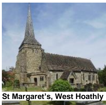
St Margaret's, West Hoathly

With winter fast approaching, accompanied by dark nights and colder, wet weather we have been considering how best to continue. As most of us are no longer working, we feel that we should change to Friday morning practices, again alternating between our towers, commencing at