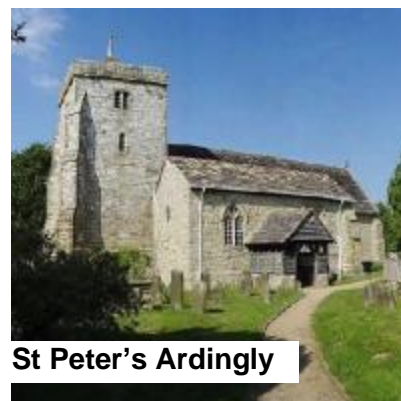
St Peter's Ardingly

This has also been useful in that we can more effectively help each other out with weddings and other commitments at a time when ringers are sometimes scarce, busy elsewhere or on holidays.